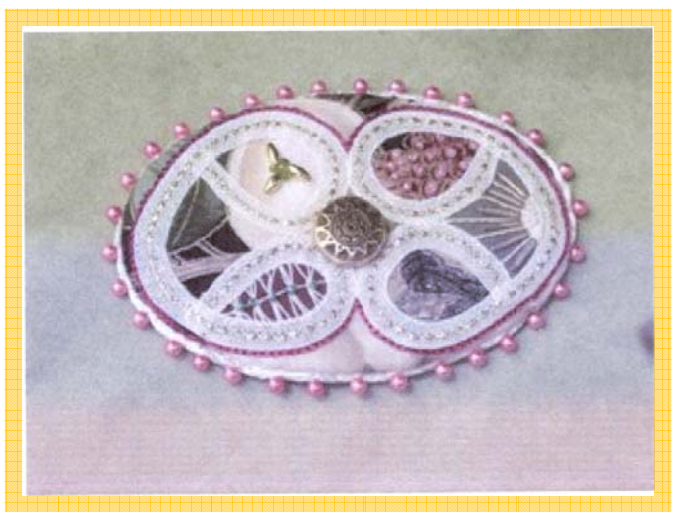
Figure 1: Picture of Battenburg Lace Project